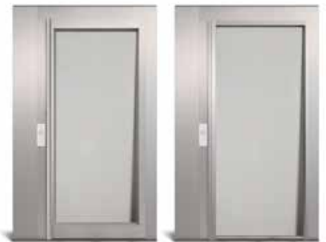
ALUMINIUM DOORS – Aluminium door AL5 (to the left) is standard for outdoor lifts. The fully glazed AL6 (to the right) is available as an option.

The LED option offers you a nice-looking lighting effect as well as a practical, additional light source at night-time.