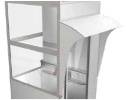
CANOPY IN STEEL – The steel canopy is very sturdy and offers you reliable protection against rain and snow at entrance and exit.