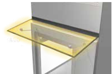
LED LIT CANOPY IN PLEXIGLAS – The canopy in plexiglas looks light and elegant and shelters you from rain and light snow at entrance and exit.

The LED option offers you a nice-looking lighting effect as well as a practical, additional light source at night-time.