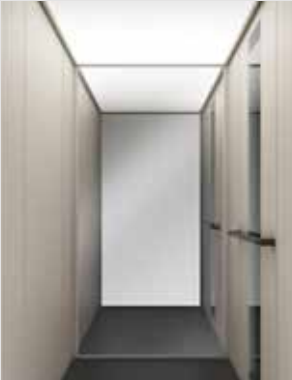
Walls: Laminate: Oyster grey, mirror and laminate with matching coated profiles: RAL1015. Black touch control. Light screen ceiling.