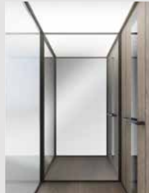
Walls: Glass, mirror and laminate: Nevada Oak. Black profiles. Touch control. Light screen ceiling. Floor: Rustic Oak.