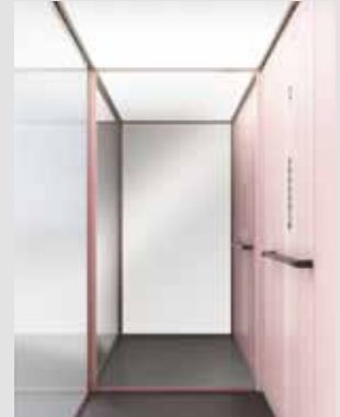
Walls: Glass, mirror and laminate: Just Rose. Matching coated profiles and control panel RAL 490. Light screen ceiling.