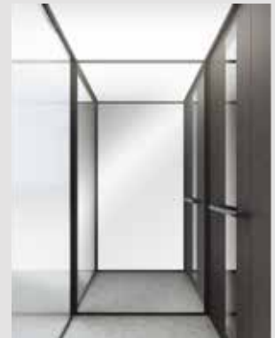
Walls: Glass, mirror and laminate: Black Wood. Black profiles. Touch control. Light screen ceiling.