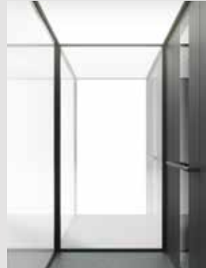
Walls: Glass, glass and laminate: Terril. Black profiles. Black touch control. Light screen ceiling.