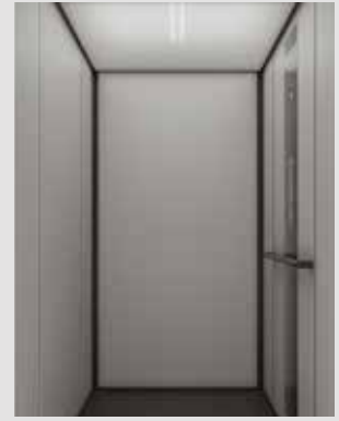
Walls: Folkstone laminate, black coated profiles. Black coated control. White coated ceiling with LED-light.