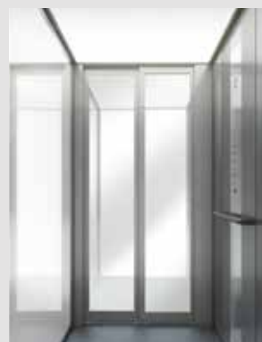
Walls: Glass, open through with glass door. Brushed Argent laminate, Black profiles. Control panel: Stainless steel. Light screen ceiling.