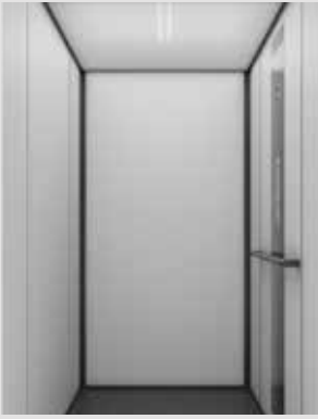
Walls: White standard laminate. Black profiles. Control panel: Black. Ceiling with LED light RAL 9016.