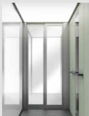
Walls: Glass, open through with glass door. Fontana laminate, black profiles. Black touch control. Light screen ceiling.