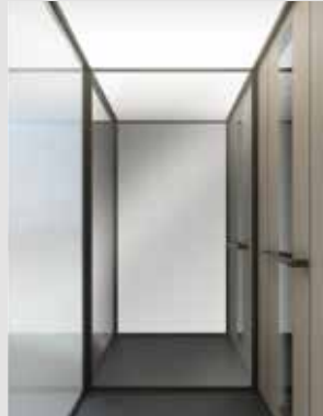
Walls: Glass, mirror and laminate: Otter. Black profiles. Black touch control. Light screen ceiling.