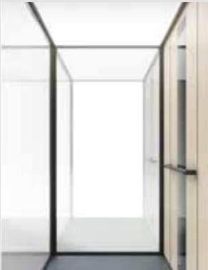
Walls: Glass and laminate: Magnolia. Black profiles. Touch control. Light screen ceiling.