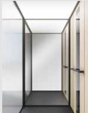
Walls: Glass, mirror and laminate: Polar Aland Pine. Black profiles. Touch control. Light screen ceiling.