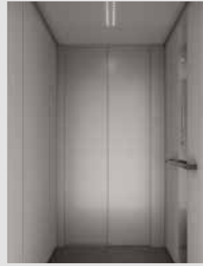
Walls: Folkstone laminate, matching profiles RAL830. Open through with white door. Control panel stainless steel. Ceiling: RAL830 with LED-light.