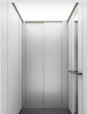
Walls: White laminate, open through with white door with matching profiles. Black touch control. Light screen ceiling.