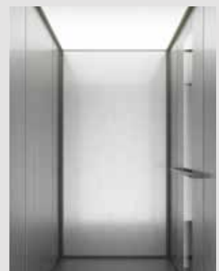
Walls: Brushed Argent laminate, Black profiles. Black touch control. Light screen ceiling.