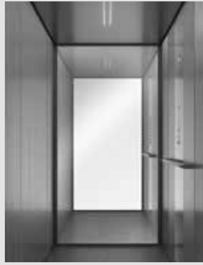
Walls: Brushed Argent laminate, mirror. Coated control in RAL9006. Coated ceiling in RAL 9006 with LED-light.